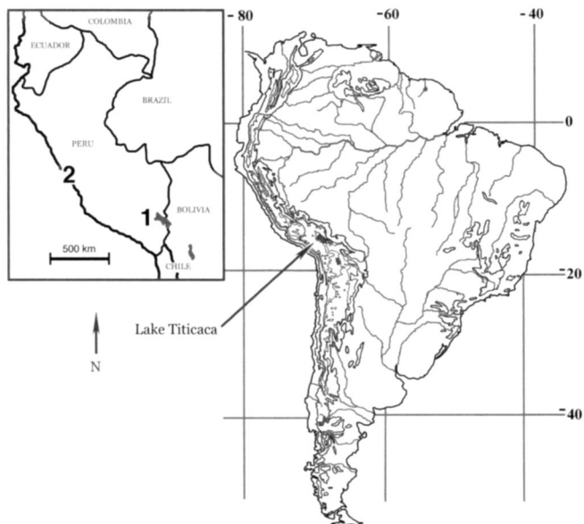
Fig. 1. Location of the Lake Titicaca Basin on the continent of South America with an inset showing the project location within the country of Peru. Numbered location on the Peru map correspond to the following places mentioned in the text; 1: Lake Titicaca, 2: Lima, Peru and the archaeological site Ancón. North arrows in all figures indicate true north with the magnetic declination in Puno, Peru at 2° west of north.

excavated at Huajje represents a rare instance of an intact, well-demarcated stratigraphic deposit that allows us to precisely define the material changes through time in silver production.