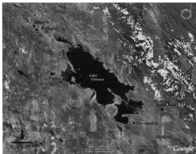
Fig. 2. The Lake Titicaca Basin of Peru and Bolivia. The Puno Bay research area and the archaeological sites Tiwanaku and Pukara are located.

The village was converted into a large ceremonial and residential center in its early periods ca. AD 100. Huajje was then incorporated into the Tiwanaku state ca. AD 600–700 as part of a larger political entity that included the island of Esteves, a few hundred meters to the southeast. Regional survey demonstrates the intrusion of Tiwanaku artifacts and iconography in this area that was otherwise culturally-affiliated with the northern Qaluyu and later Pukara cultural traditions (1). The construction of a stylistically-Tiwanaku pyramid and ritual/residential site on the nearby island of Esteves provides clear evidence of Tiwanaku investment in Puno Bay. Tiwanaku influence in the region